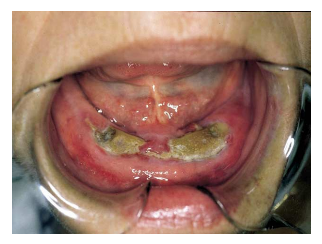
FIGURE 1. Exposed necrotic bone in the mandible related to pamidronate.

Marx et al. Bisphosphonate-Induced Exposed Bone of Jaws. J Oral Maxillofac Surg 2005.