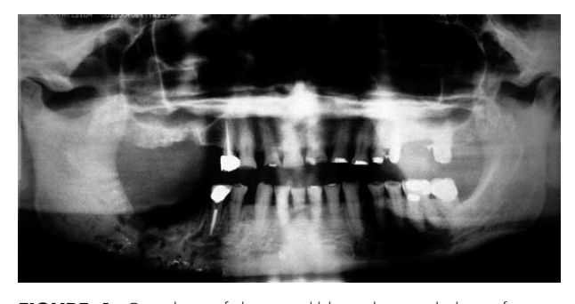
FIGURE 4. Osteolysis of the mandible with a pathologic fracture resultant from a tooth removal while the patient received pamidronate bisphosphonate therapy.

Marx et al. Bispbospbonate-Induced Exposed Bone of Jaws. J Oral Maxillofac Surg 2005.