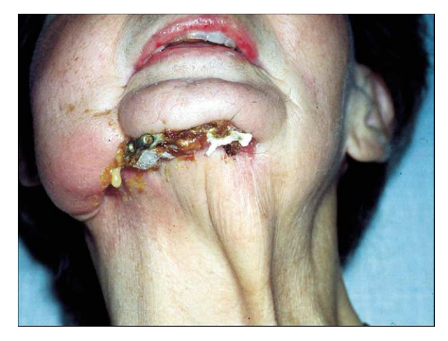
FIGURE 3. Significant cutaneous tissue loss with protruding bone and titanium plate with secondary infection as a result of attempted surgery to debride bisphosphonate-related osteonecrosis of the jaws.

The mandible and maxilla were the only bones involved in these exposures. Eighty-one exposures (68.1%) occurred exclusively in the mandible, 33 (27.7%) exclusively in the maxilla, and 5 (4.2%) simultaneously in the mandible and maxilla. The posterior mandible in the area of the molars was the most common site of exposure (n = 78; 65.5%), followed by the posterior maxilla (n = 27; 22.7%).