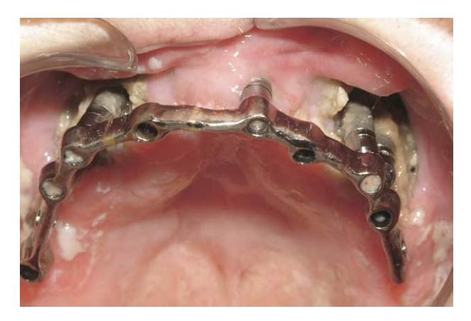
FIGURE 8. Dental implants in the jaws in patients receiving pamidronate or zoledronate risk implant loss and bone exposure as in this case.

As soon as the treating oncologist prescribes bisphosphonate therapy, the patient should be referred to an experienced dentist or oral and maxillofacial surgeon for an urgent examination. Close and ongoing communication between the 2 is crucial, and commencement of bisphosphonate therapy should be deferred until dental and oral surgical treatments have been completed. At the minimum, the dental examination should consist of clinical and panoramic radiographic examinations with individual periapical films where indicated. Dental treatment is aimed at eliminating infections and preventing the need for invasive dental procedures in the near and intermediate future. This may include tooth removal, periodontal surgery, root canal treatment, caries control, dental restorations, and dentures. These patients should