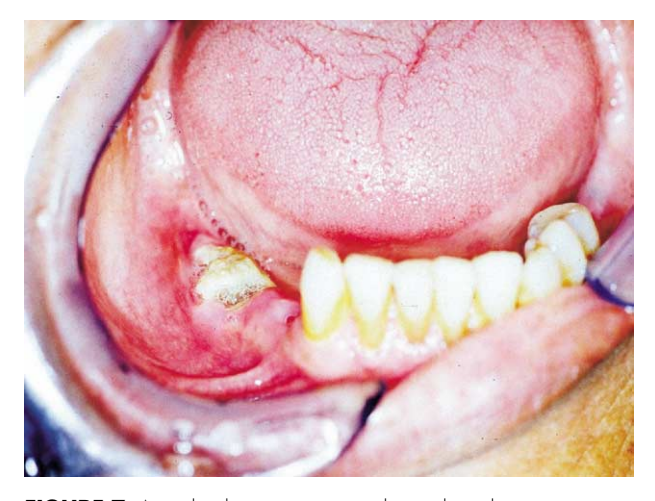
FIGURE 7. A nonhealing extraction socket such as this is a common complication when teeth are removed in patients receiving pamidronate or zoledronate therapy.

Marx et al. Bisphosphonate-Induced Exposed Bone of Jaws. J Oral Maxillofac Surg 2005.